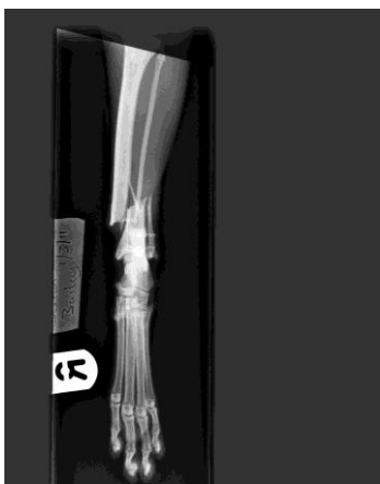
x-rays showing the fracture before and after repair

As before, if you feel your rabbit has any health issues or may require treatment for parasites, please ring us or come to the surgery and we can advise on the best course of action. For rabbits on our pet health plan we include four treatments per year for E. cuniculi